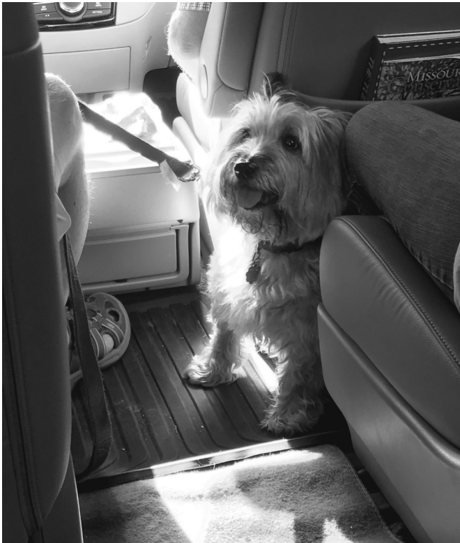
Fig. 1: Good Boy En Route