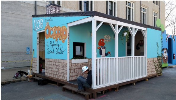
KGB Presents Octodad: A Perfectly Normal Booth

Octodad~ Nobody suspects a thing Octodad~ He's got a good thing going on