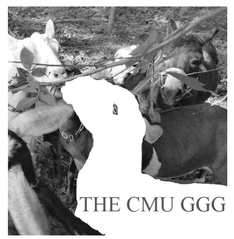
The Gates Goats Ghosters Official Logo

The Gates Goats Ghosters, or Goaties, were founded around the idea that some of the Gates Goats—the mammals which were rented to tame the grass outside of Gates last year—have returned as ghosts to haunt the area of campus they once roamed. According to their unofficial student group charter, the Goaties' goal is "to gain recognition of this issue on campus, encourage respect for the Gates Goats, and help the lost souls of the Gates Goats go peacefully into the goatafterlife." It's an ambitious set of objectives, and one that doesn't necessarily garner positive attention from other students on campus.