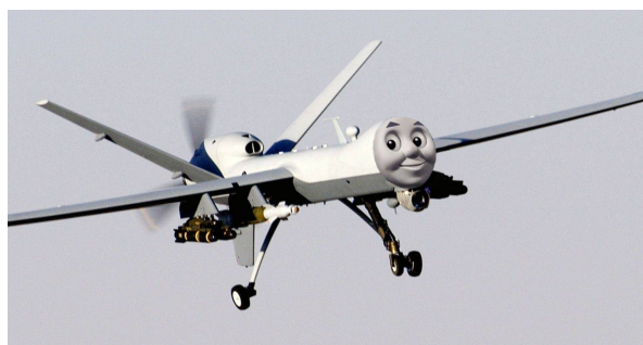
Submitted by mrquinn