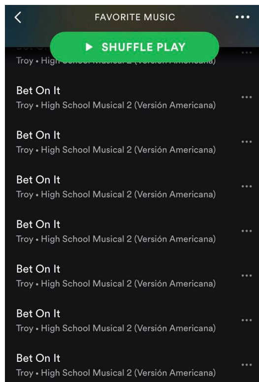
Submitted by mjmurphy