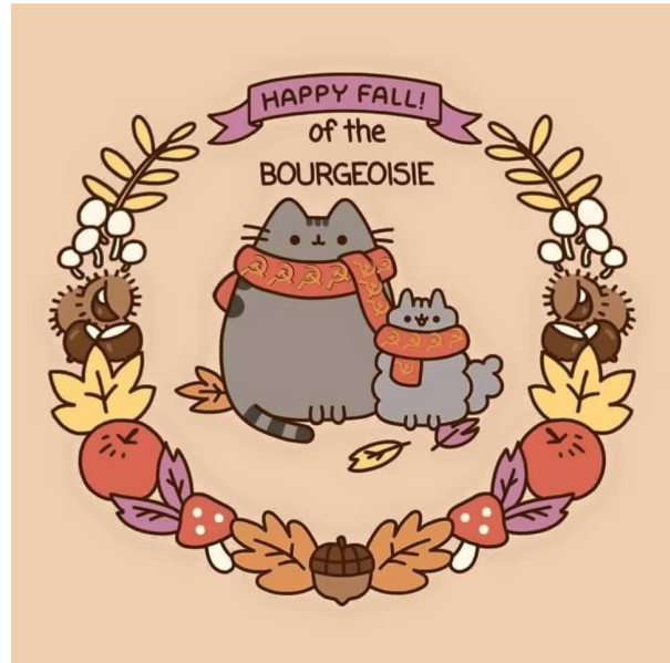
Submitted by dkirby to CMU KGB