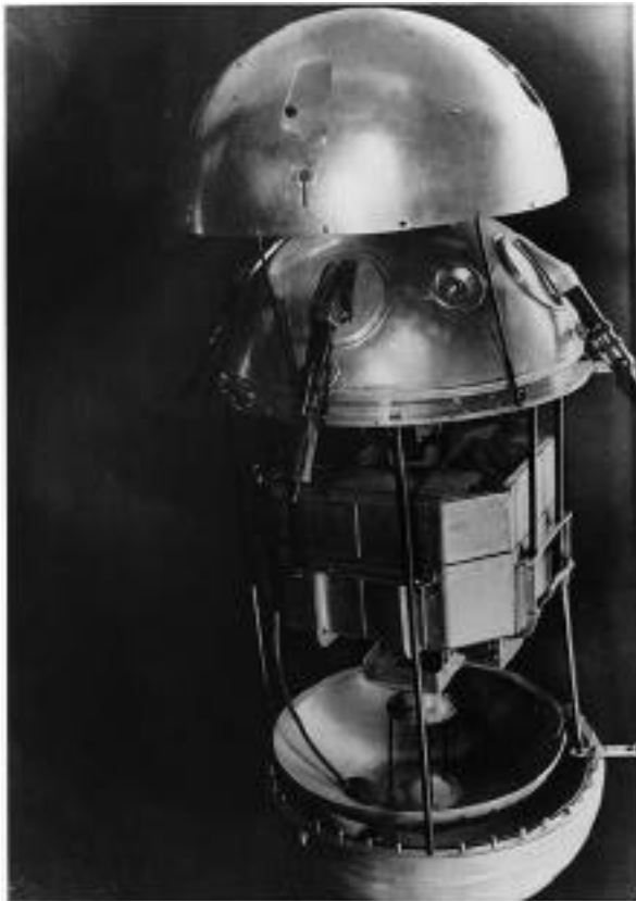
Sputnik 1, exploded view.