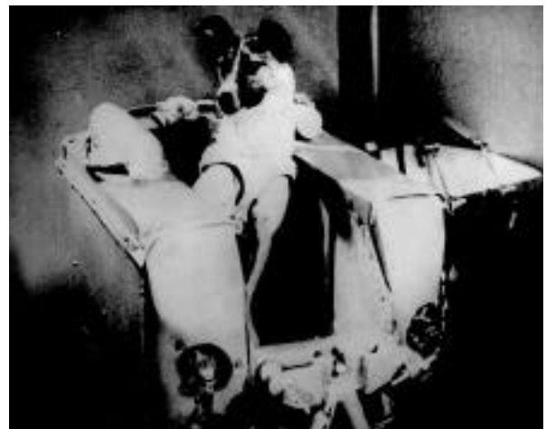
1957. Laika. Sputnik 2.