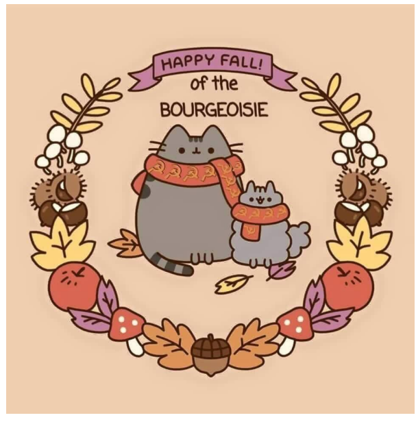
Submitted by dkirby to CMU KGB