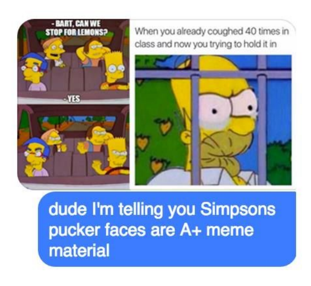
Submitted by mrquinn