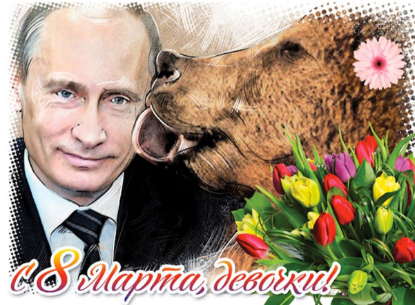
Thanks to Fibbage. We all thought that one was fake.

But here's a picture of him being licked by a bear in celebration of International Women's Day last year. This was published by a Russian state-owned magazine.