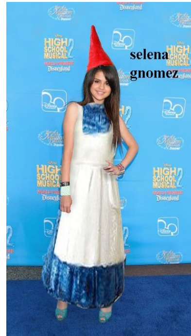
Submitted by npostnik